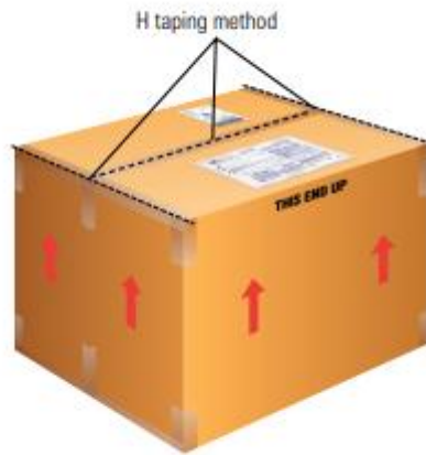
H taping method (From Fedex.com)

Make sure every step done well and then let's send it out!